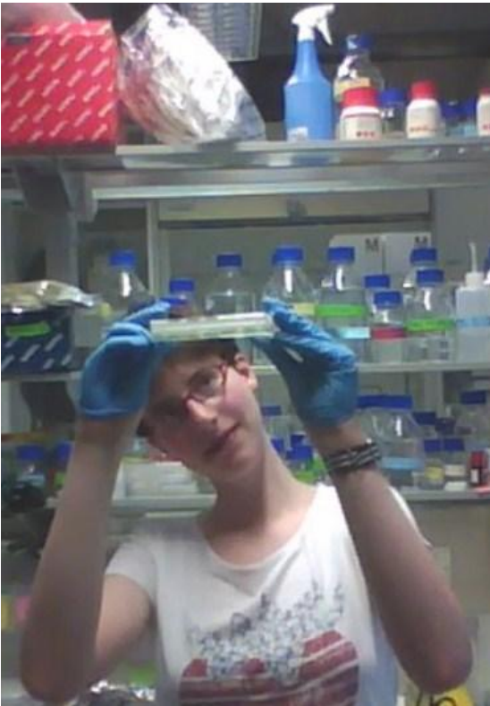
Figure 1 - Me working in the lab

I am currently 12 th -grader at Edith-Stein-Schule in Erfurt. In summer 2016 I am going to graduate. I discovered my interest in biology by reading books and magazines about biological topics. I have already attended the selection contest for the International Biology Olympiad twice. Thanks to the Förderverein der Internationalen Biologieolympiade e.V. I had the opportunity to do an internship at the Max Planck Institute of Molecular Plant Physiology in Golm. I was interested in plants before, but never thought about the deeper molecular backgrounds of their existence in a way, as I learnt in my internship. Besides I had only very little experience in working in a molecular biological lab.