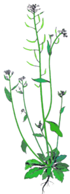
Figure 4.1 - Arabidopsis thaliana

Arabidopsis thaliana is a small flowering plant that belongs to the Brassicaceae family. It is a widespread model organism in plant biology. A small and well researched genome, a rapid life cycle, easy cultivation and reproduction in limited space and efficient transformation by means of Agrobacterium tumefaciens are counted among its advantages. Although Arabidopsis thaliana itself has no meaning in agriculture, it is a good representative of physiology of higher plants (cf. [2]). Therefore it can give important information regarding the cultivation of plants of agricultural importance.